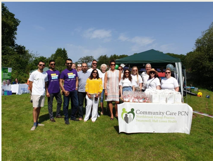
Staff from all 3 Practices in the Community Care PCN at the Launch Event on Saturday 29 th June at Jacey Park (next to Northbrook Group Practice)