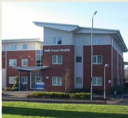
Hall Green Health 979 Stratford Road Hall Green B28 8BG

“WORKING TOWARDS EXCELLENCE AND INNOVATION IN PATIENT CARE”